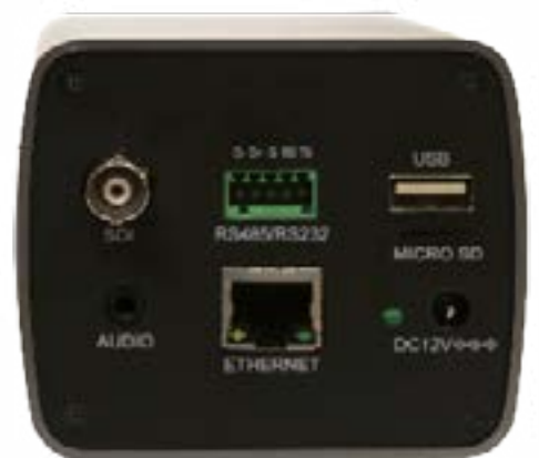
Rear of Camera